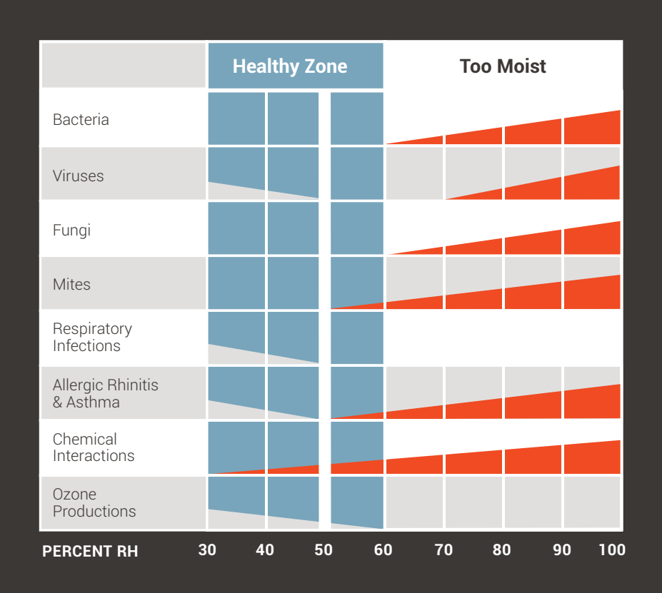
Chart data by the American Society of Heating, Refrigeration and Air Conditioning Engineers (ASHRAE).

Check out the chart to see how humidity affects your health. As the width of the bar increases, so does the likelihood of flourishing microbes and illnesses.